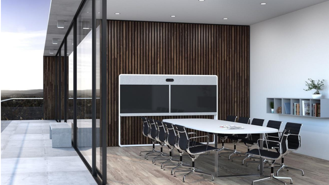
Figure 2. Cisco Webex Room 55 Dual in a large conference room